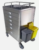
Model: HO-M01 Product name: Stainless Steel MRI trolley MR compatible to 1.5T, 3.0T