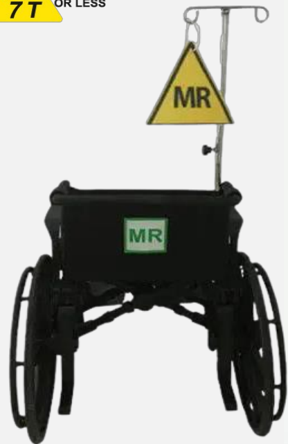
Model: HO-W101 Product name: plastic MRI wheelchair MR compatible to 1.5T, 3.0T and 7.0T