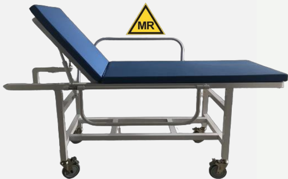
Model: HO-708A Product name: Aluminum MR stretcher trolley MR compatible to 1.5T and 3.0T