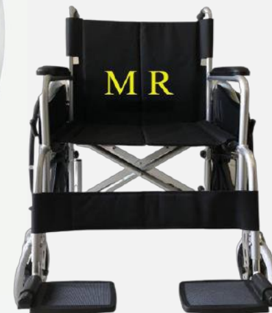
Model: HO-W102 Product name: Aluminium MRI wheelchair MR compatible to 1.5T, 3.0T