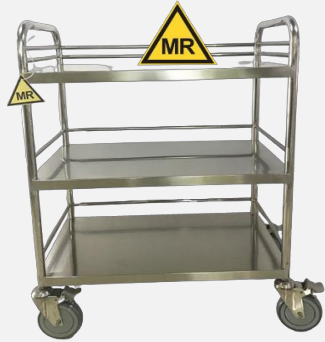
Model: HO-M02 Product name: MRI instrument trolley MR compatible to 1.5T, 3.0T