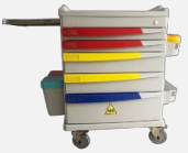
Model: HO-M05A Product name: ABS MRI trolley MR compatible to 1.5T, 3.0T