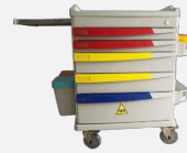
Model: HO-M05A Product name: ABS MRI trolley MR compatible to 1.5T, 3.0T