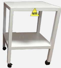
Model: HO-M03 Product name: MRI Coil Transport Trolley MR compatible to 1.5T, 3.0T