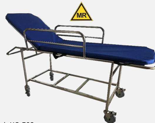
Model: HO-708 Product name: Stainless Steel MR stretcher trolley MR compatible to 1.5T and 3.0T